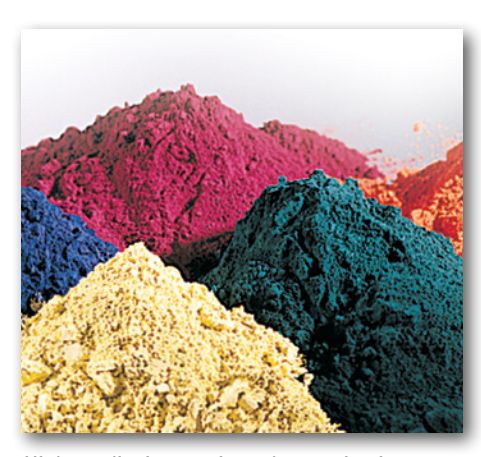
High-quality inorganic and ceramic pigments.

MS Colorfast45 uses a combination of select inorganic and ceramic pigments for coloring. These pigments offer years of exceptional performance in harsh weather and resist color change, acids, alkalis and oxidizing agents found in harsh environments.