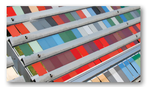
Test fences hold metal panels at a 45-degree angle in south Florida for maximum exposure.

Metal Sales stands behind its commitment to provide the highest-quality products available – and has for more than 50 years. That's why MS Colorfast45 includes an industry-leading 45 Year finish warranty.*